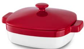
KitchenAid® Ceramic 1.9-Quart Ceramic Casserole Dish with Lid Model No. KBLR19CRER

Purchase a select KitchenAid® Convection Digital Countertop Oven* and receive a FREE KitchenAid® Ceramic 1.9-Quart Casserole Dish with Lid (a $29.99 value) by mail.