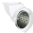
KitchenAid® Rotor Slicer/ Shredder Model RVSA